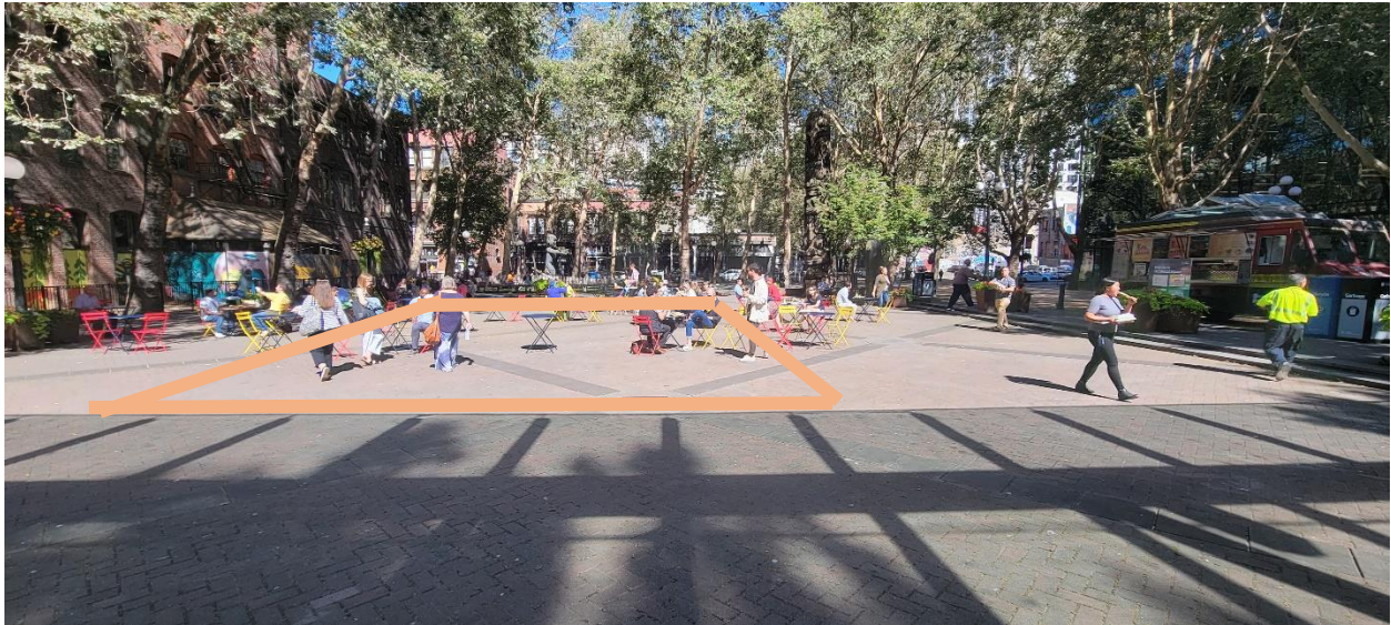
Photo of Proposed Area Location

Footprint for proposed roller rink installation includes a 40 ft x 80 ft roller rink with a temporary 8 ft x 8 ft storage shed.