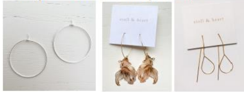
Earrings – Gold Fill Earrings $20-$52