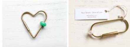
Healing Gemstone Keychains $24