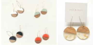
Earrings - Wood and Resin Earrings $38-$46