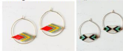
Earrings – Beaded Earrings $58-$64