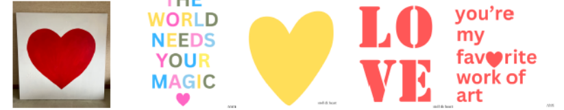
Hand Painted and Digital Heart Art $48 - $300 (for very large canvas size)