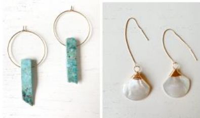
Earrings – Stone and Natural Shell Earrings $42-$52