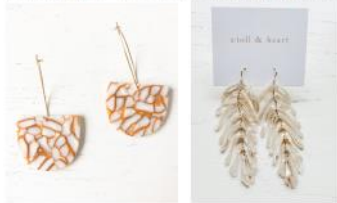
Earrings - Resin Earrings $38-$64