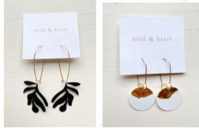
Earrings – Painted Brass Earrings $48