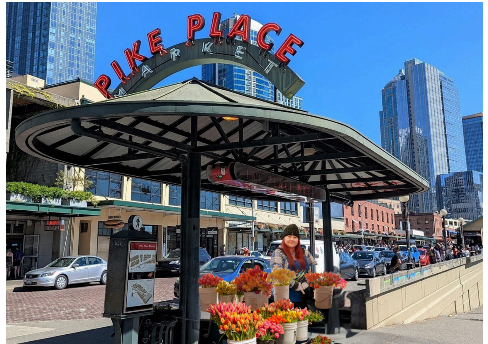
Rendering of pergola with proposed use

The PDA requests approval for this use through September 30, 2026.