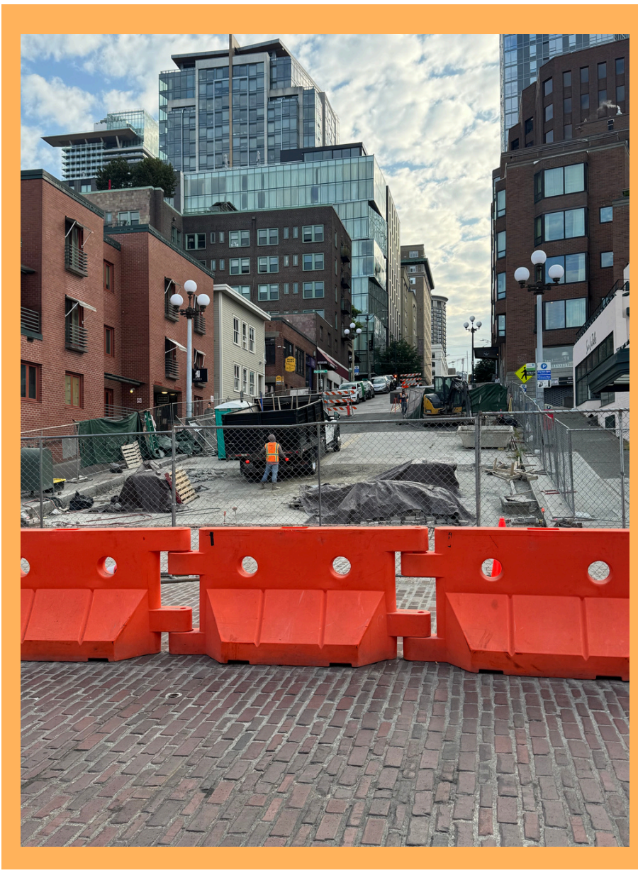
Brick replacement work on Stewart Street