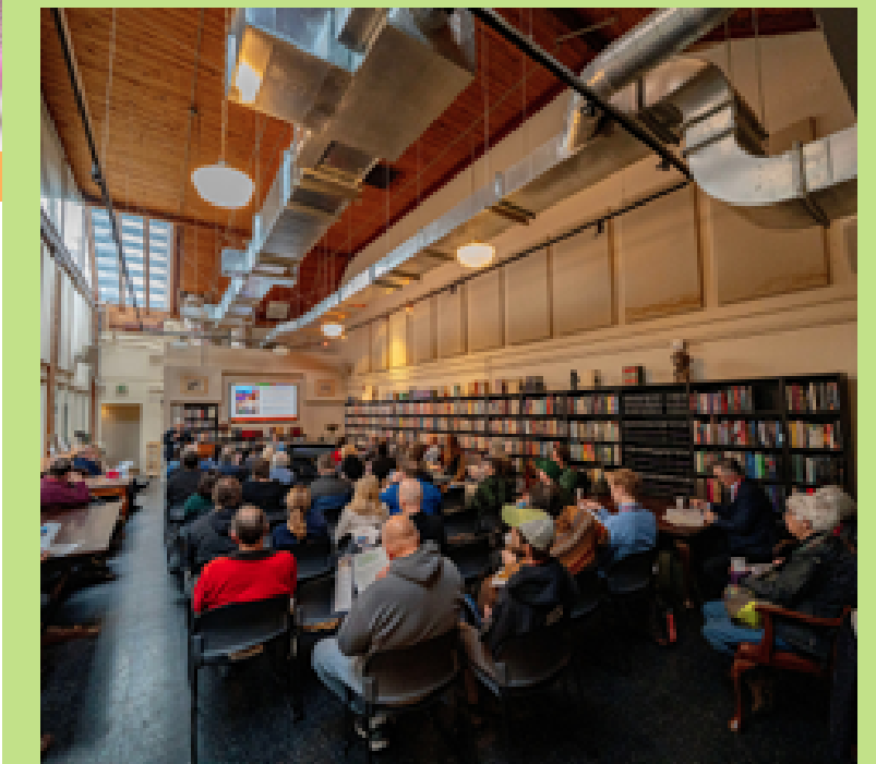
Community Convening Session at Folio