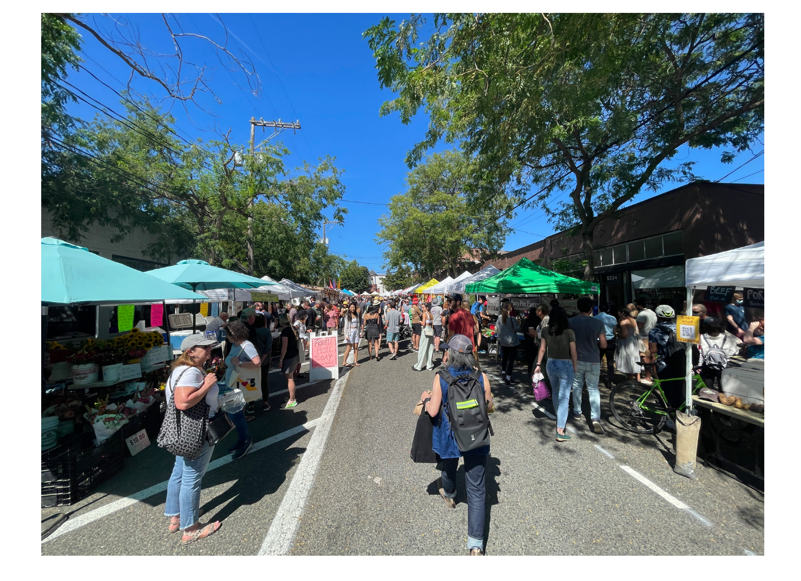
Existing - Everyday