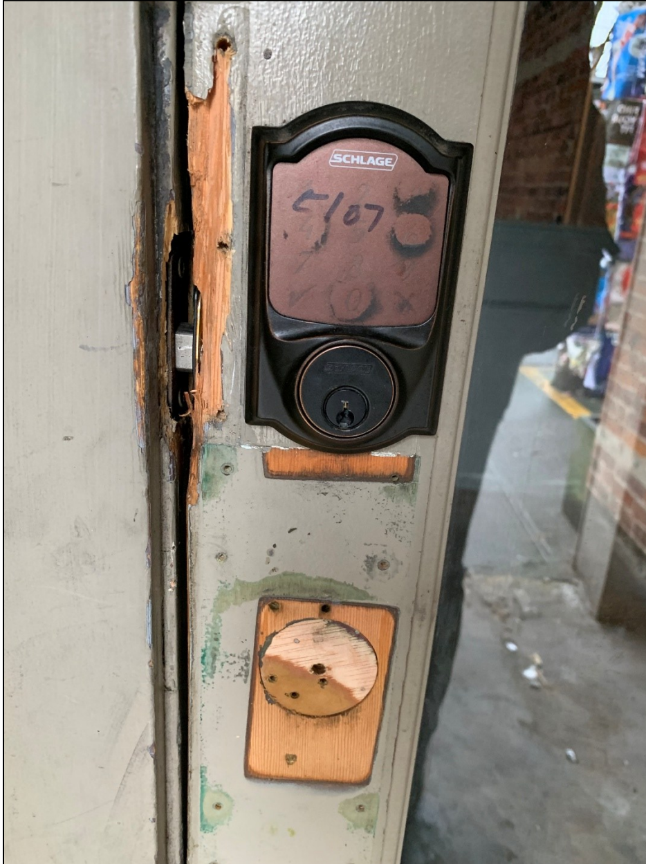
Figure 14. Damaged door, handle, and lock