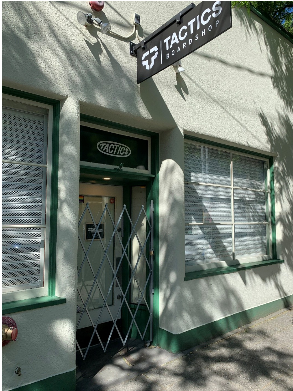
Figure 17. Images of scissor gates in use on Ballard Ave