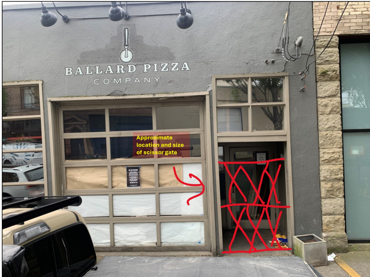
Figure 8. Scissor gate specifications