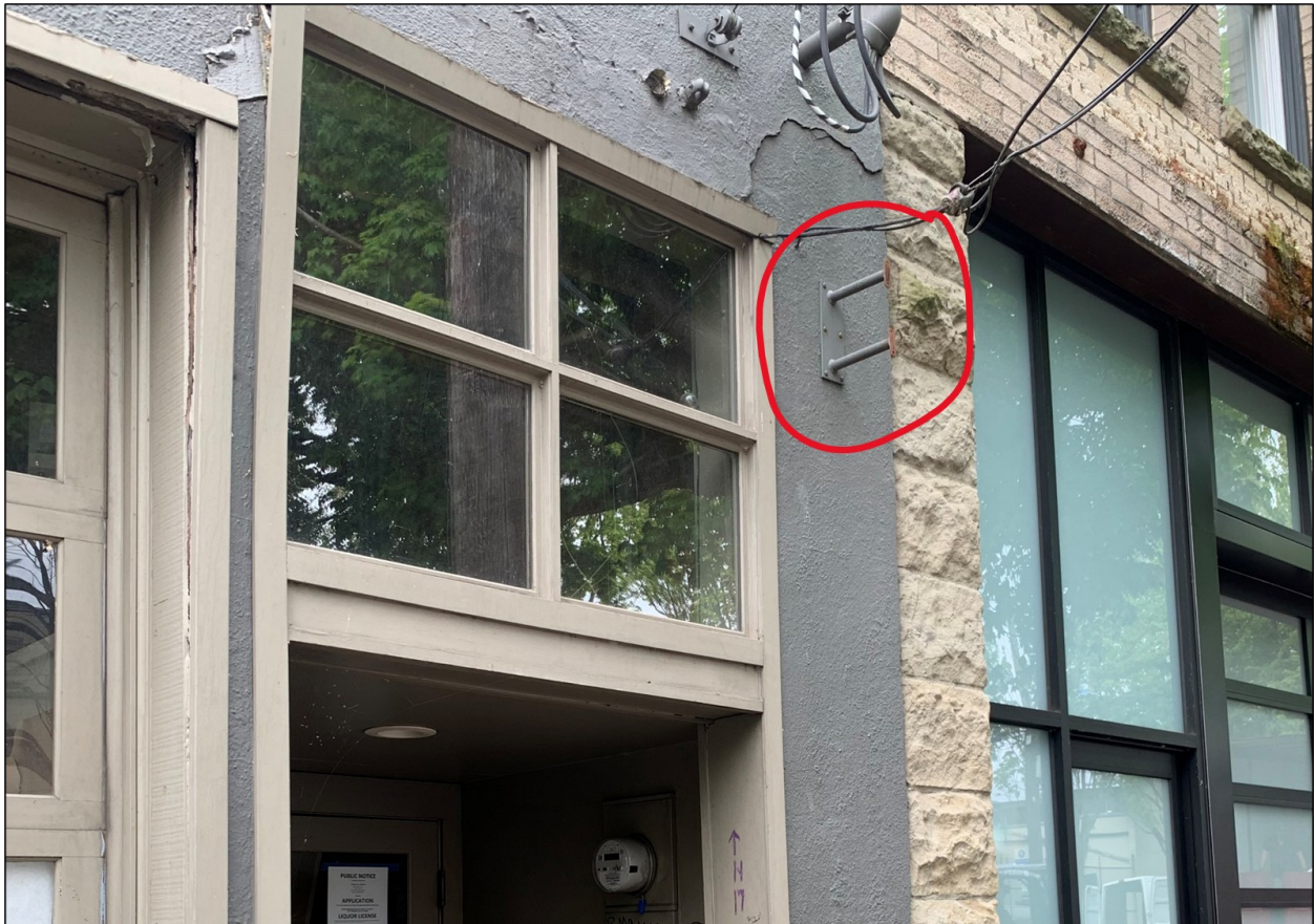
Figure 9. Mounting locations circled