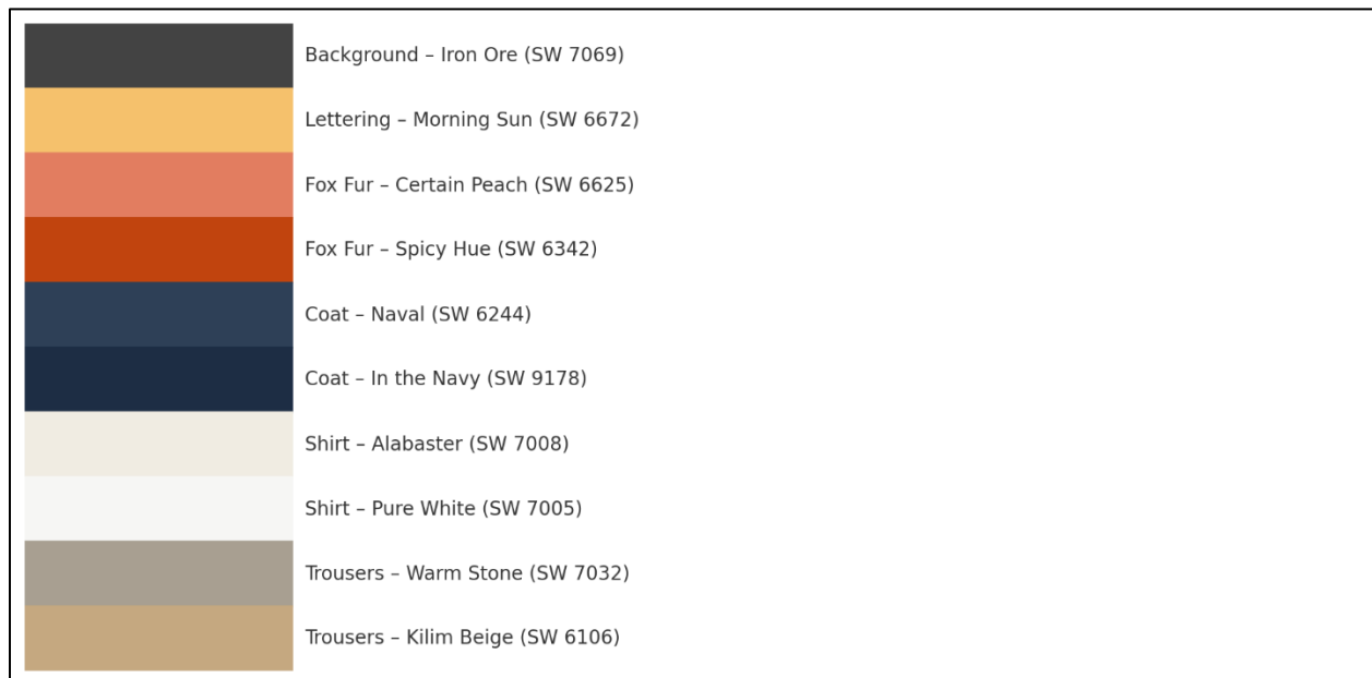
Figure 10. Blade sign color swatch