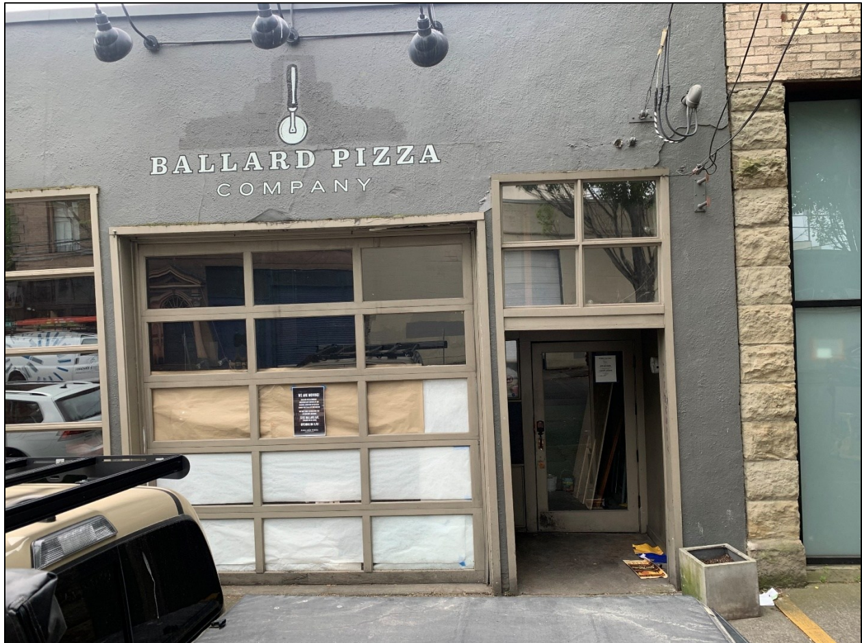
Figure 2. Current view of front facade

Photographs of the storefront and surrounding streetscape are included on the following pages. These images show the current conditions of the facade where the sign and gate will be mounted.