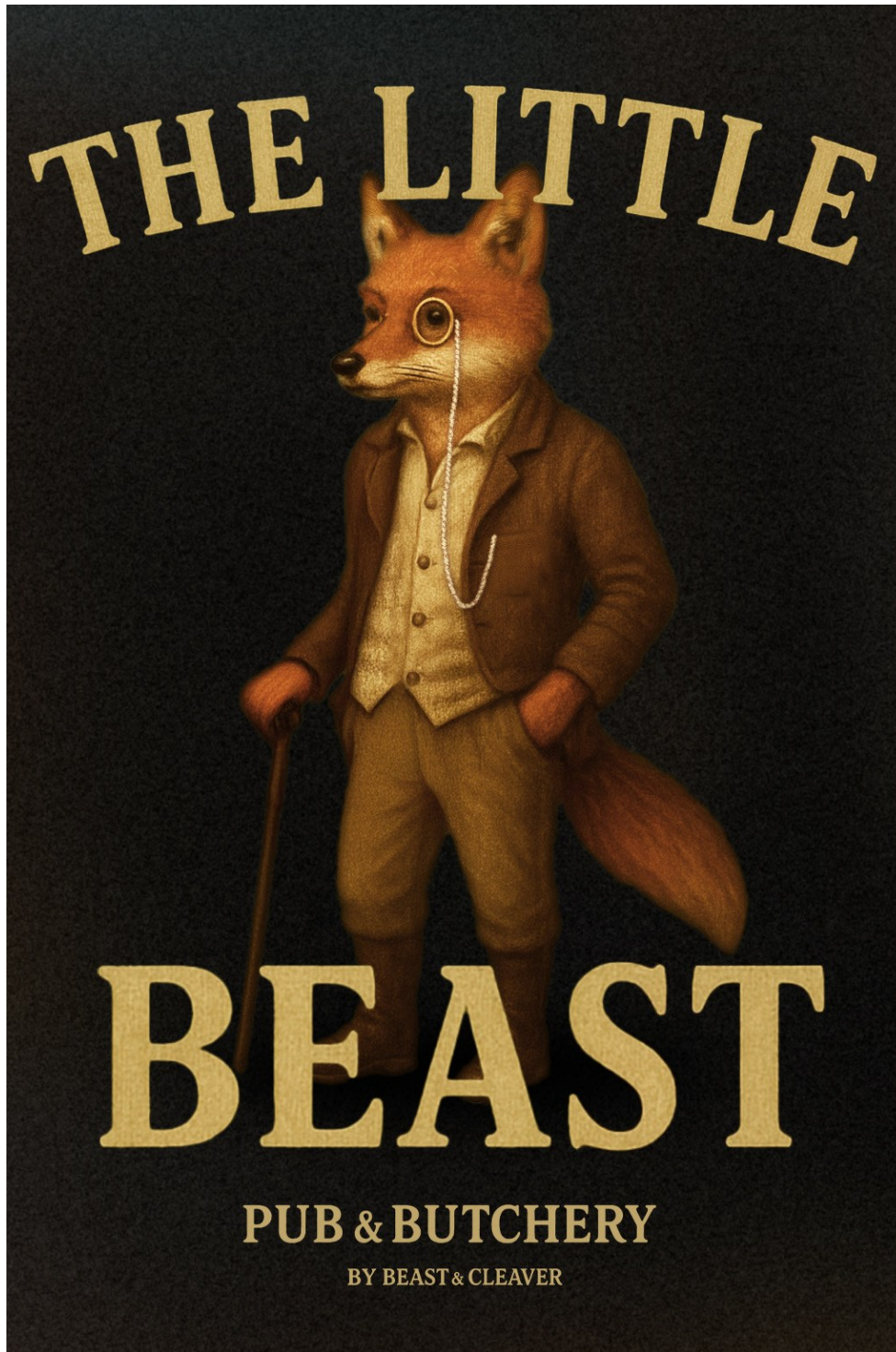
Figure 6. Proposed blade sign artwork