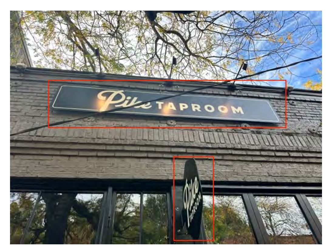
NE ELEVATION - EXISTING SIGNAGE SCALE NTS