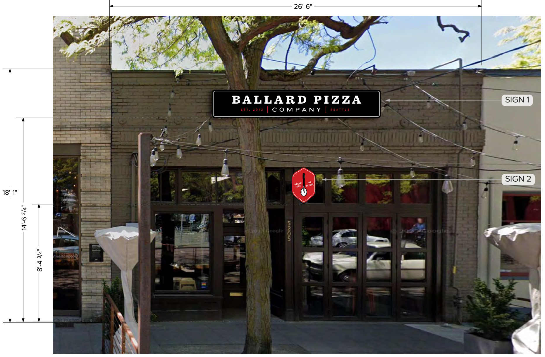
NE ELEVATION - REFACED SIGNAGE SCALE: 1/4" = 1'