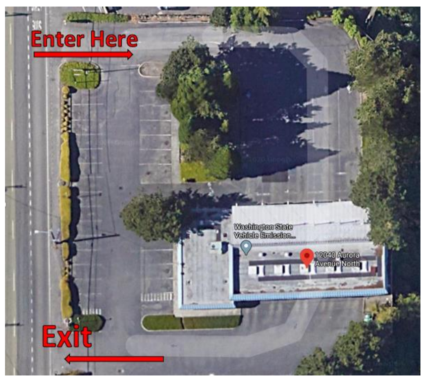
Satellite Image of Aurora Site

Address (links to Google Maps): 12040 Aurora Ave N, Seattle WA 98133