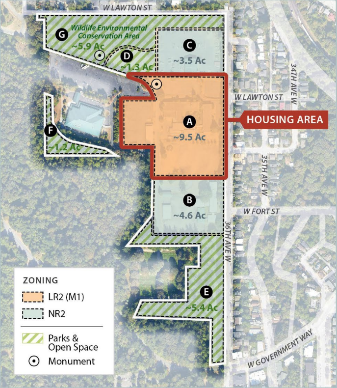
OPTION A: 2019 PLAN

This is the baseline for all alternatives. It reflects the Fort Lawton Redevelopment Plan (“2019 Plan”).