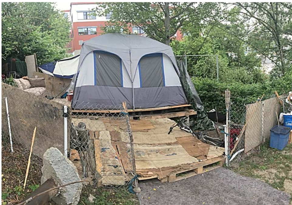
Exhibit A: Inspection Photos