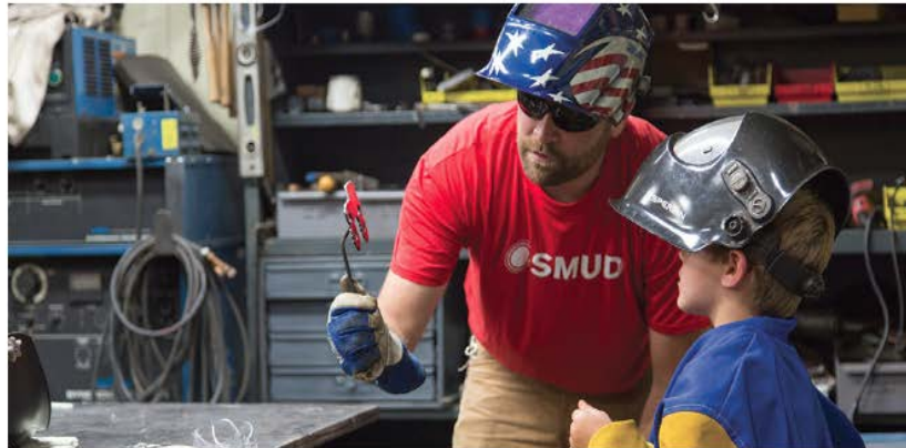
2017 Family Safety Day