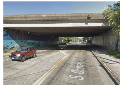
Crews will replace the lighting under the State Route 99 overpass on South Cloverdale Street.