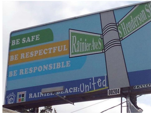
One of four billboards in Rainier Beach that displays the community’s values: Be Safe, Be Respectful and Be Responsible

This grant is the first in the nation to expand PBIS to community settings and will involve an assessment of whether the integration of these two frameworks can improve school climate and overall rates of youth crime and community safety.