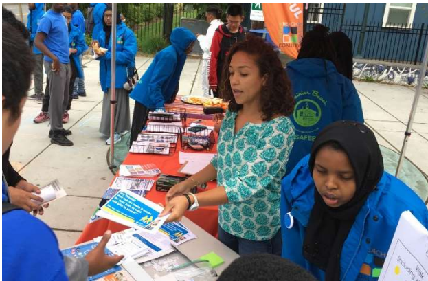
Corner Greeters activate the hotspots by hosting pop-up events

We continue to provide technical assistance in the implementation and evaluation of Rainier Beach: A Beautiful Safe Place for Youth (ABSPY) , a community-led, place based approach to reducing youth victimization and crime in the Rainier Beach neighborhood. ABSPY focuses on five “hotspots” in the Rainier Beach neighborhood where crime has been highly concentrated. These are 1) Rainier Avenue South & South Henderson Street, 2) Rainier Avenue South & South Rose Street, 3) the Rainier Beach light rail station, 4) Lake Washington Apartments, and 5) the Rainier Beach Safeway shopping area.