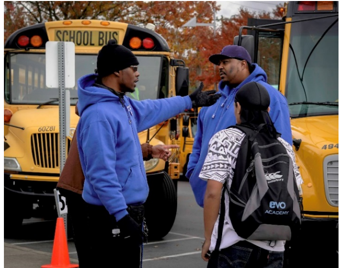
In one of ABSPY interventions, Safe Passage guardians help ensure that Rainier Beach students stay safe after school.