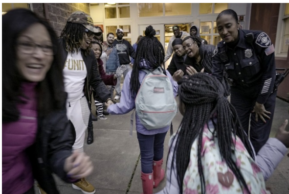
Community members greet students on January 22, 2019 at Emerson Elementary, one of the six Rainier Beach schools implementing PBIS.