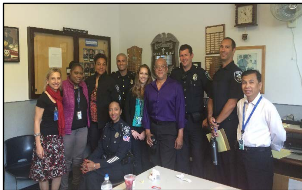
PBIS training at the South Precinct.

A member of our office is also serving as the lead evaluator on two grants ($99,000 award in 2015; and $133,000 award in 2016) from the U.S. Department of Education to implement Positive Behavioral Interventions and Supports (PBIS) in Rainier Beach schools and community settings. Decades of rigorous research and practice have found PBIS to be an effective framework for helping schools serve as effective learning environments, reducing suspensions and discipline referrals, and improving academic performance, attendance, perception of safety, and organizational health of schools. The PBIS project in Rainier Beach is the first in the country to expand the use of PBIS from schools to community settings including the community center, library, public spaces, and local businesses. A preliminary evaluation of the PBIS grant will be published in the fourth quarter of 2017.