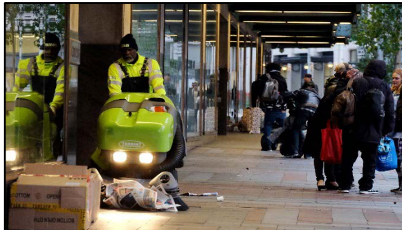
Clean Ambassador Using a Green Clean Machine.

To determine whether the MID was providing the required services, we reviewed key documents (e.g., staff schedules and contracts), analyzed MID output data, interviewed MID managers and staff, observed MID operations, and interviewed City of Seattle and community stakeholders.