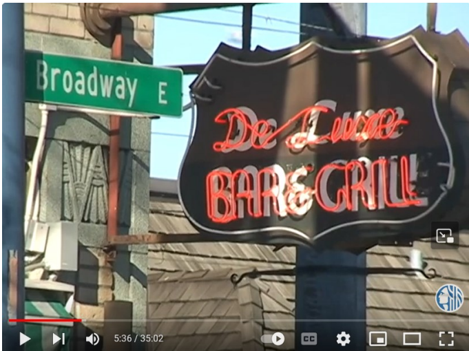
B-roll, Broadway Capitol Hill. Event 12962 , Record Series 3902-01, SMA.

Recently uploaded to SMA's YouTube channel is B-roll video footage showing various neighborhoods in Seattle circa 2003-2004, including Capitol Hill, Pioneer Square, Queen Anne, and the University District. Street scenes include shots of businesses, traffic and public transit, parks, and pedestrians.