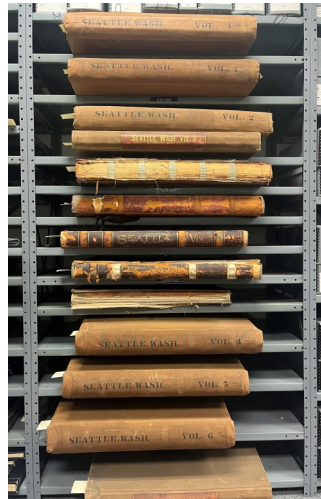
Sanborn and Baist atlases shelved in SMA's Immediate Access Vault.

Also newly processed are several series containing correspondence, memoranda, and findings of fact related to appeals from the Office of the Hearing Examiner. Appeals of Director's Interpretations (Series 3403-02) and Housing Code Violation Appeals (Series 3403-15) contain records related to decisions issued by the director of the Department of Construction and Land Use (later the Department of Planning and Development). Appeals of Ethics and Elections Commission Decisions (Series 3403-07) date from 1996-1998 and include appeals of decisions regarding ethics and campaign finance issues.