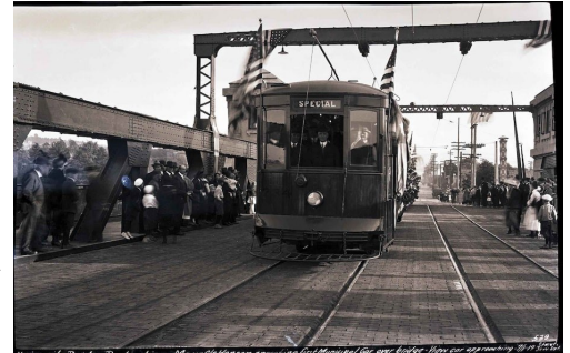
Streetcar at the dedication of University Bridge, July 1, 1919.

Crosscut featured a photo of the first P-Patch in a recent piece on the history of the Seattle P-Patch program. And a 1909 City Light photo held by SMA showing the interior of the Georgetown steam plant was included in a Seattle Times Halloween-themed article about ghost stories inspired by the history of the building.