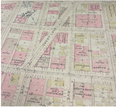
Page from 1912 Baist atlas showing part of downtown Seattle.

Recently transferred to SMA from the Puget Sound Regional Archives is a series of Sanborn Insurance Maps (Series 9965-01) created between 1905 and 1930 and corrected up to 1962, and one Baist Real Estate Atlas (Series 9965-02) dating from 1912. Both types of maps are excellent resources for researching property history in Seattle and we are grateful to add them to our holdings.