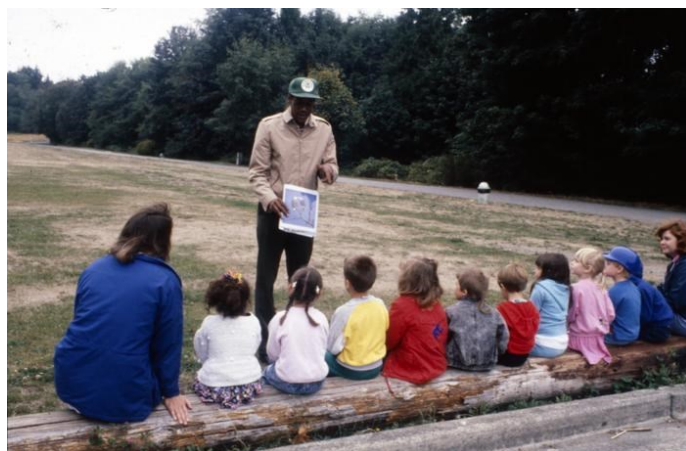
Docent/Volunteer teaches children about eagles, circa 1990s. Image 206284 , Series 5801-07, SMA.

Find the exhibit on SMA's website under Exhibits and Education .