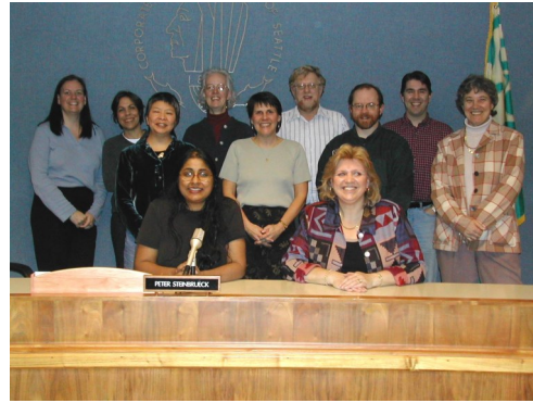
Legislative Department Central Staff in 2002. Image 152874 , Series 4600-11, SMA.

held at SMA. But in addition to hard copy records, nearly 27,000 digital files in 15 different subseries are