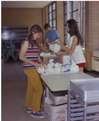
Images 206581 (above left); 206566 (above right); and 206574 (left), August 6, 1971. Series 2613-07, SMA.