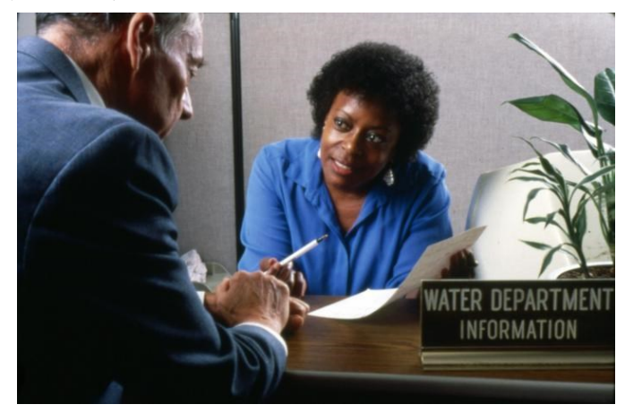
Water Department employee, circa 1990. Image 102245, Series 8200-14, SMA.