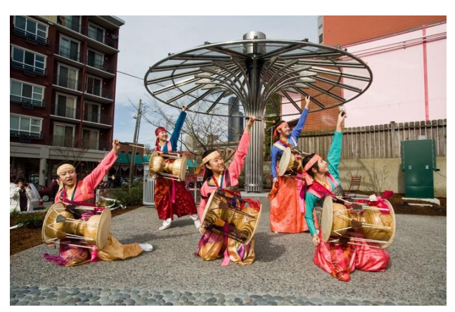
International Children's Park reopening, March 3, 2012. Item 205026, Series 5802-15, SMA.

Covering the last two decades, and featuring Parks facilities all over the city, the photos in this collection show opening and groundbreaking ceremonies with public officials, public art, walkways and trails, community centers, playgrounds and courts, skate parks, viewpoints, and gardens.