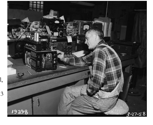
Repairing a traffic signal, 1958. Image 57190, Series 2613