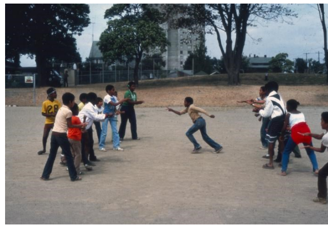
Youth playing games in an unidentified playfield, circa 1980. Item 204985, Series 5802-09, SMA.