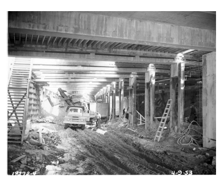
Battery Street Tunnel under construction, April 9, 1953. Image 44265, Series 2613-07.

Other images from SMA's collections were used to illustrate news stories such as a <u>KIRO story</u> on the I-5 Ship Canal Bridge; a