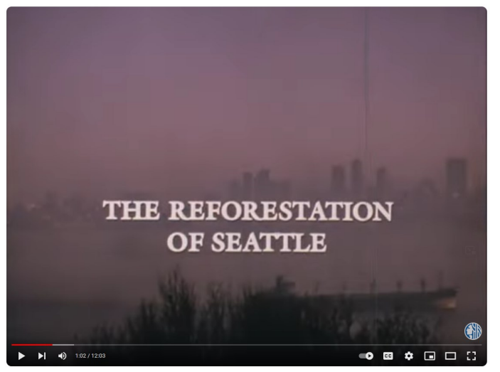
The Reforestation of Seattle, Event 443, Record Series 2613-09, SMA.

Recently posted to SMA's YouTube channel is a 1983 documentary on the evolution of Seattle's street trees. The Reforestation of Seattle was produced by the WA Department of Natural Resources and the City of Seattle, and includes images of parks and public spaces, streets and traffic, and residential neighborhoods. Also posted is a series of raw footage from the documentary.