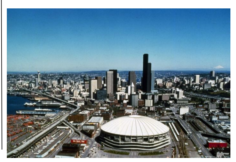
Aerial view of the Central Business District with the Kingdome, circa 1985. <u>Image 205761</u>, Series 1629-01, SMA.

We enjoyed having her in the office and wish her the best back at school!