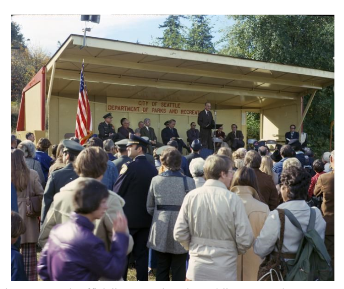
Discovery Park officially opened to the public on October 28, 1973. Attending were Senator Henry Jackson (seen speaking here), Mayor Wes Uhlman, former Mayor J. D. Braman, and about 300 members of the public. Image 195979, Series 2613-07. SMA.