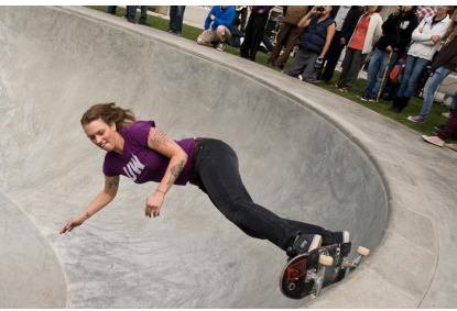
Above: Delridge Skate Park opening day, September 17, 2011, <u>Item 204909</u> Left: Public art in Marra Desimone Park, February 2, 2022, <u>Item 204195</u> Series 5802-15, SMA.

Images from Department of Parks and Recreation Slides (Series 5802-09) covering the 1940s through the 1980s are also being processed this year. Browse for fun images of roller skating at Green Lake, bike riding and Seattle residents engaged in various states of play and sport.