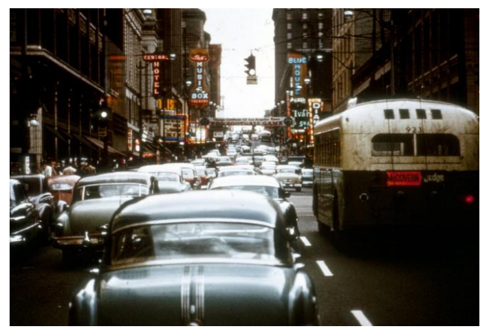
Item 205599, Series 1204-01, SMA.

This circa 1950 photo showing 5th Avenue in downtown Seattle, full of traffic and brimming with theater marquees, was recently posted to <a href="MAiss-Flickr site">SMAis</a> end has been popular with followers.