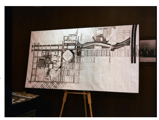
Display model of the Bay Freeway, April 18, 1970. Image 192095, Series 2613-07, SMA.

R.H. Thomson Expressway in 1970, but the Bay Freeway was still a go. Plans approved that year included an elevated section that critics believed would wall off Lake Union from the rest of the city. Letters and telegrams came