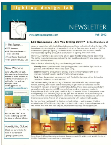
Lighting Design Lab Newsletter, Fall 2012. Series 1212-01, SMA.

Also processed are Lighting Design Lab Newsletters (Series 1212-01) dating from Winter 1990 to Fall 2018. Opened in 1989, the Lighting Design Lab was created to further developments in energy efficiency, technology control, and to provide lighting quality for designers and users of lighting systems. The