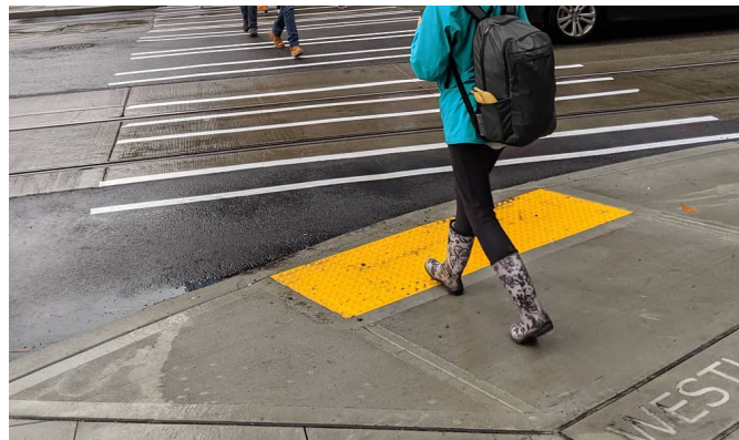
New and upgraded curb ramps at many intersections along N 50th St.

For cost savings and efficiency, the rapid flashing beacons at N 50th St at Dayton Ave N and Woodland Park Ave N will be constructed and installed at a later day by SDOT crews. It is currently anticipated that they will be installed in 2022.