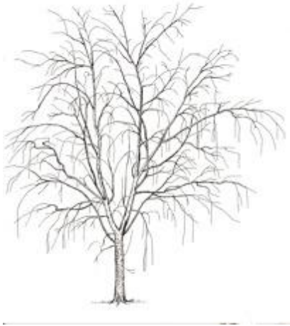
Figure 3. Poor tree architecture with two codominant stems borne low on a 30 year old tree.