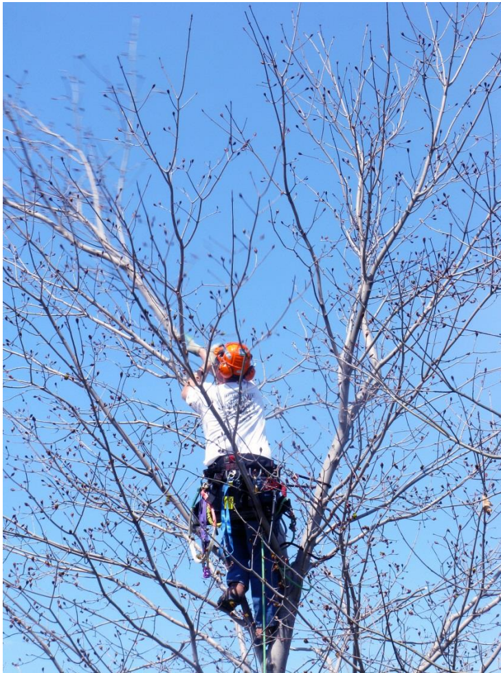
Figure 4. Arborist is ready to make a reduction cut on a codominant stem (left stem) that is competing with the leader (right stem).