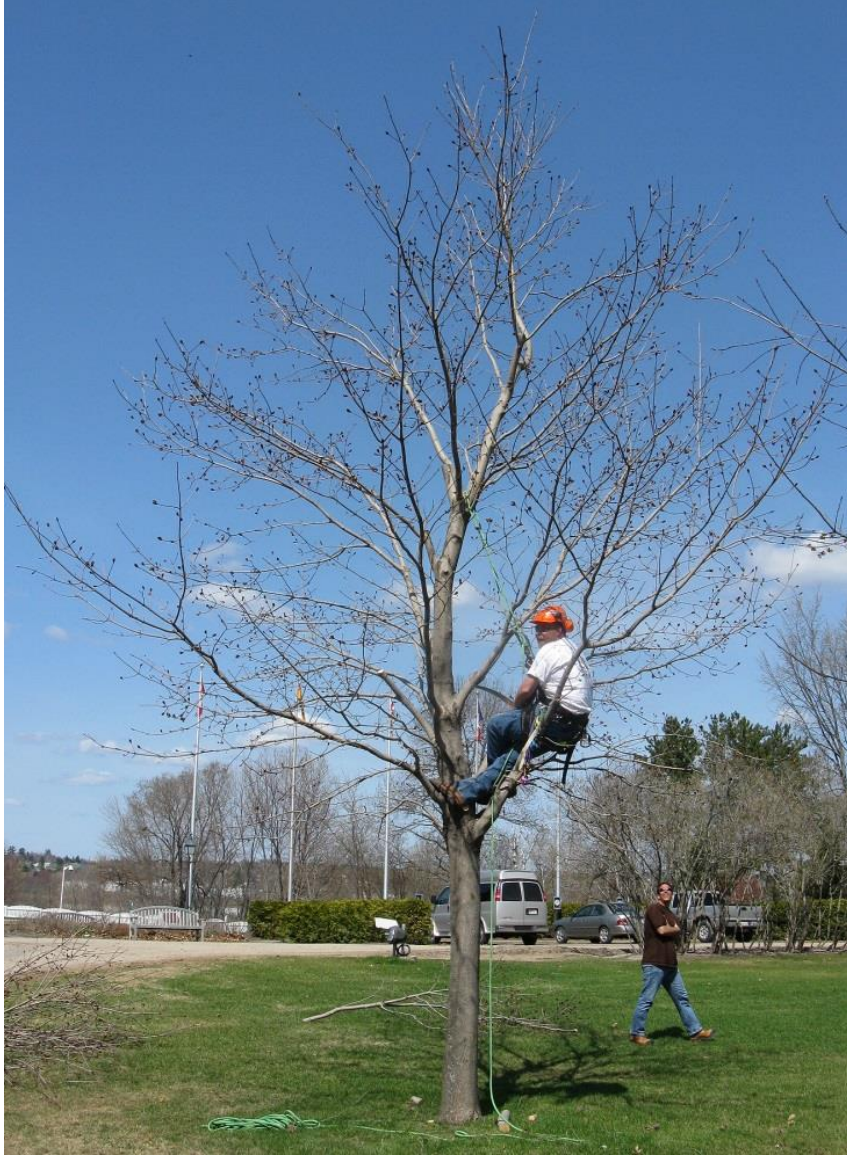
Figure 5. Tree has good structure with a dominant leader after making about 6 reduction and removal cuts.