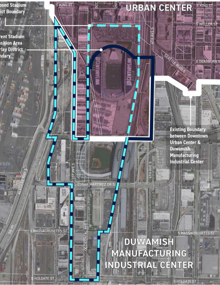
Professional sports stadiums stakeholders proposed a comprehensive plan amendment to create a stand-alone stadium district with a unique purpose and function, removing land from industrial designation.