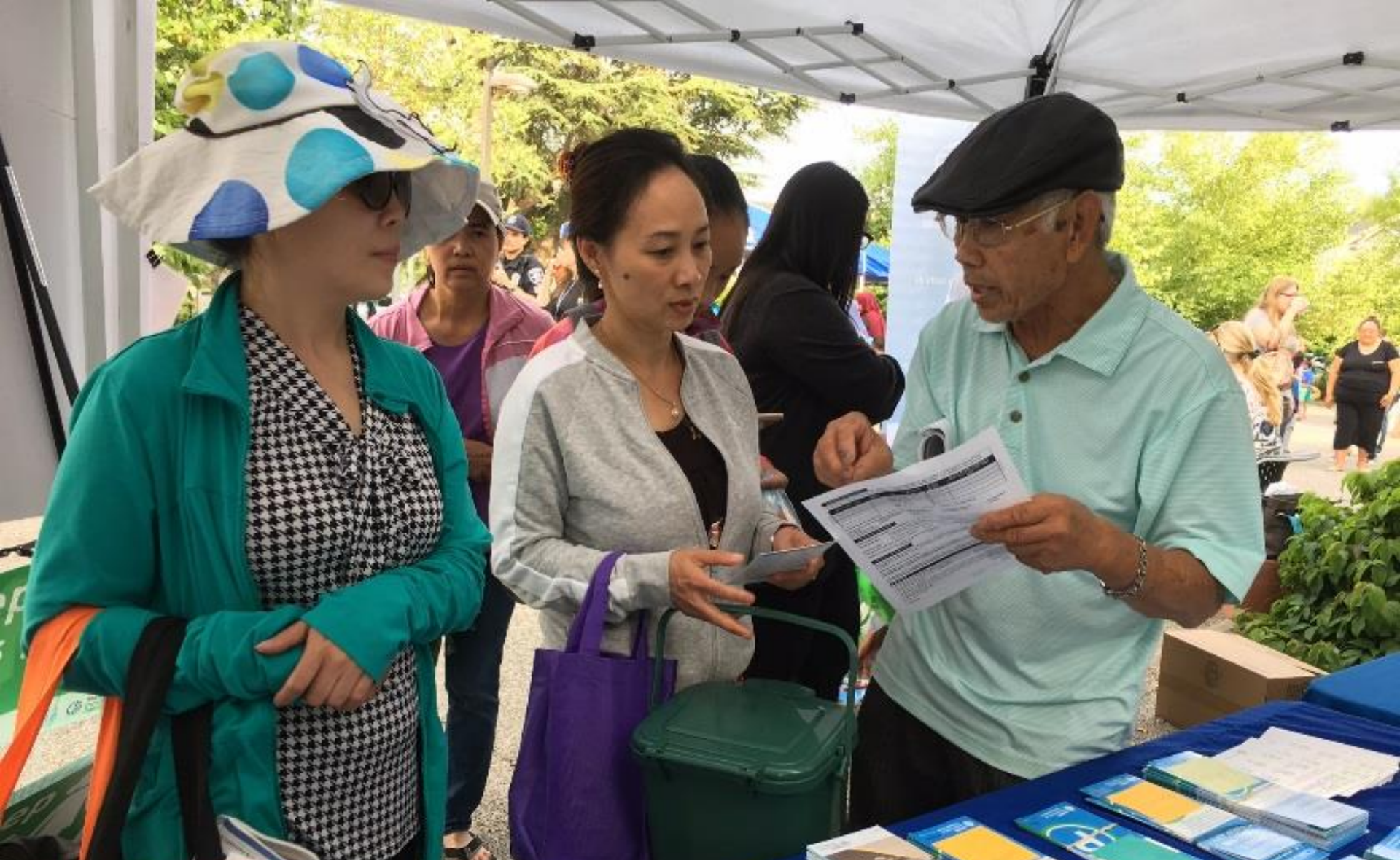
Community Liaisons interpret affordable transportation.