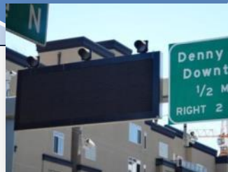
e.g. ITS applications