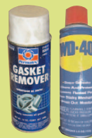
Dareeraha loo isticmaalo inay wax adag kala furfurto Dareere Ku-milme ah Shamacyada Holca ee la dhigo meelaha wax ka dhacaan