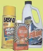
Waxyaabaha Guriga Lagu Nadiifayo

Ilaa Waxa la Ogot yahay: Waxa loo ogol yahay qofkii macmiilkiiba 50 galaan maalintii; Lama ogola weel mugiisu dhaafsan yahay 5 galaan