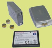
Batariyada: guriga iyo baabuurba loo ogol yahay. Xad: 5 batari baabuur