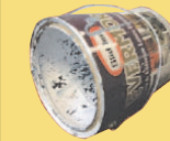
Ranjiga ka samaysan caaga la khafifiyey (Waa la ogol yahay Qasaacadooyinka ranjigu ka dhamaaday in lagu rido qashinka iyada oo furku ka furan yahay)

SOO WAC DEGMAA KING COUNTY QAYBTEEDA QASHINKA ADAG 1-800-325-6165, QAYBTA. 6-4466