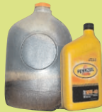
Saliida Baabuurta La Isticmaalay iyo ta Cusuba