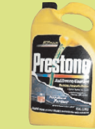
Waxyaabaha aan barafobin