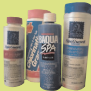
Alaabaha Meelaha Dabaasha iyo meelaha caafimaad ahaan lagu maydho