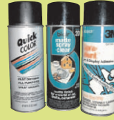
Alaabaha Qofku u-isticmaalo inuu ku maararobo