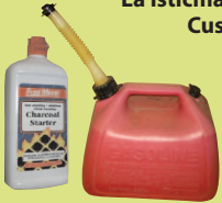
Dareerayaasha Dabku Qqabsado Ilaa Waxa la ogol yahay: ilaa 30 galaan oo batroola