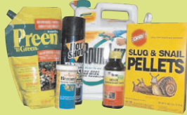
Alaabta Loogu Talogalay Cowska iyo Beeraha