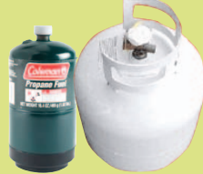
Gaasta, iyo Gaasta loo diyaariyey dareera ahaan ee loo isticmaalo karista cuntada iyo kululaynta guryaha