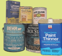
Ranji Ka Samaysan Saliid, waxyaabaha wax Khafifiyaha iyo Daxalka Lama ogola waxyaabaha Khafiifka ah ee ka samaysan caaga