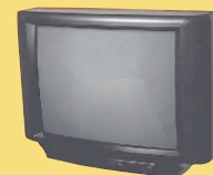
Alaabta Telefshinka, iyo Kumbutarka Eleqtroniga

SOO WAC 1-800-RECYCLE AMA WAXAAD TAGTAA SHABAKADA www.TakeItBackNetwork.org