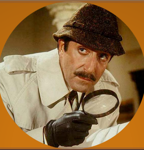
..to increase FOG inspector efficiency

We will increase awareness of code requirements before business open from current 40% to 85%