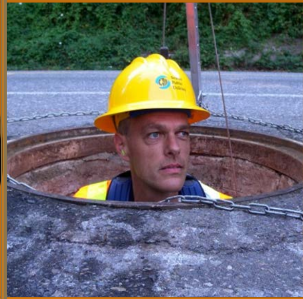
...to reduce Drainage & Wastewater Line of Business risk.

We will reduce inspector enforcement time from between 50 to 70% to between 5 to 10% by 2033.