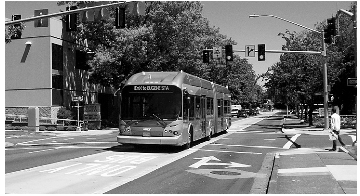
EmX, Eugene, Oregon

The Madison Street corridor is an opportunity for Seattle to design and implement state-of-the-art bus rapid transit (BRT) improvements. The 2.1-mile corridor will run from Colman Dock to 23rd Avenue and will improve access to neighborhoods and employment centers from downtown Seattle to First Hill, Capitol Hill and the Central District. Enhanced east-west connections and transfers to Third Avenue transit, Link light rail, the Center City Connector, and the First Hill streetcar will also expand mobility options beyond the corridor.