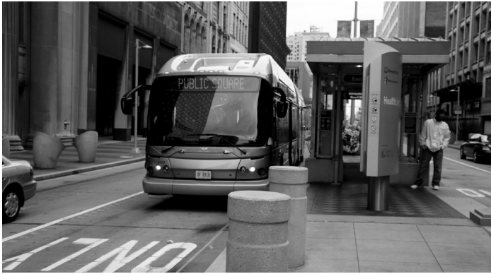
HealthLine, Cleveland, OH