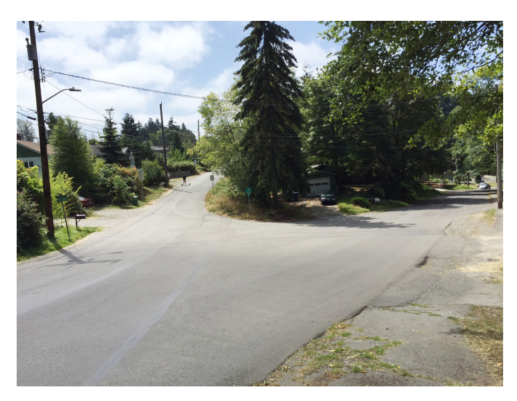
Existing conditions looking southwest on 18th Ave SW and SW Orchard St