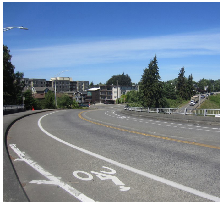
Looking west on NE 70th St toward 6th Ave NE