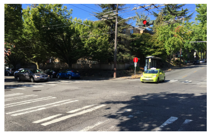
Intersection at E Thomas St and 19th Ave E

Throughout the life of the project, we'll coordinate with the King County Metro Route 8 Improvement project, our neighborhood greenway program, and with the new development at the Capitol Hill Light Rail station at E John St and 10 Ave E.