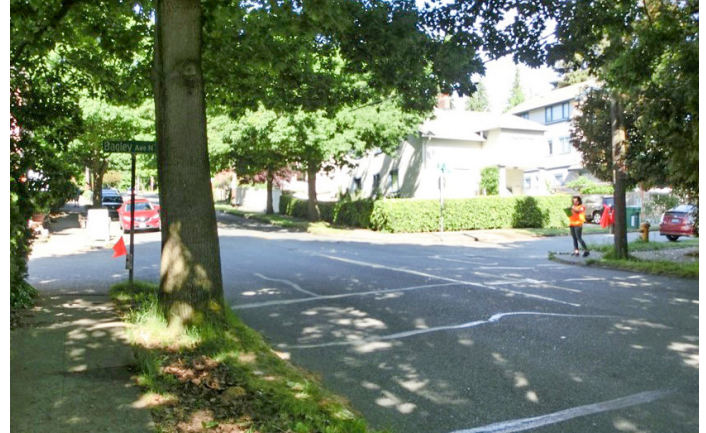
Looking west on N 40th St toward Bagley Ave N. Existing crossing flags shown on east side of intersection.