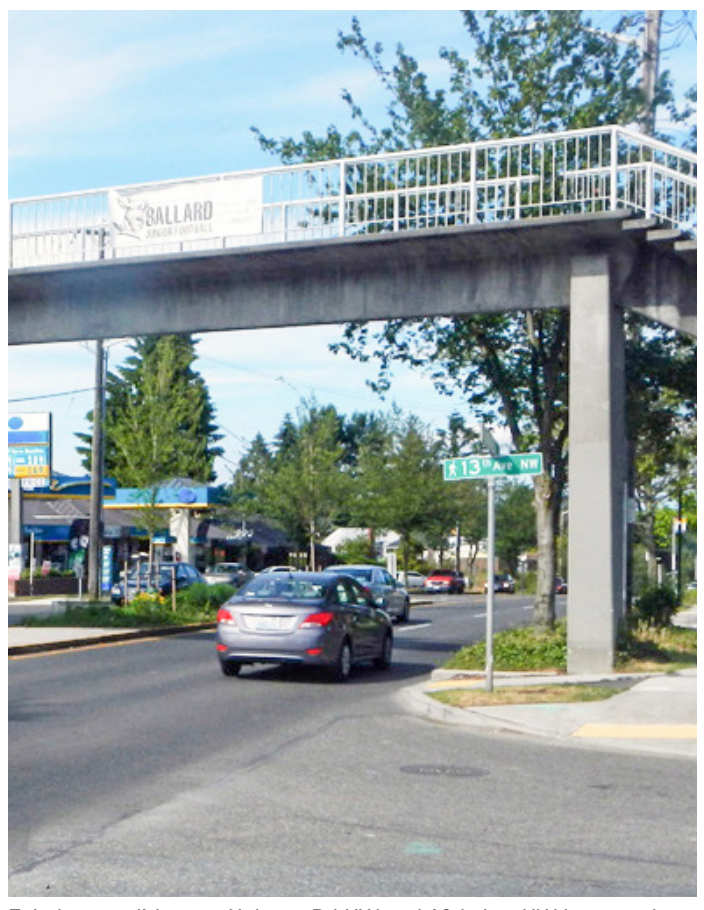
Existing conditions at Holman Rd NW and 13th Ave NW intersection