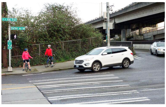
People waiting to cross the intersection at Harbor Ave SW and SW Spokane St