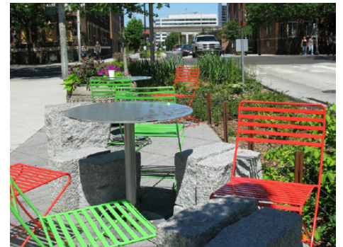
Example of public space on Bell St, downtown.