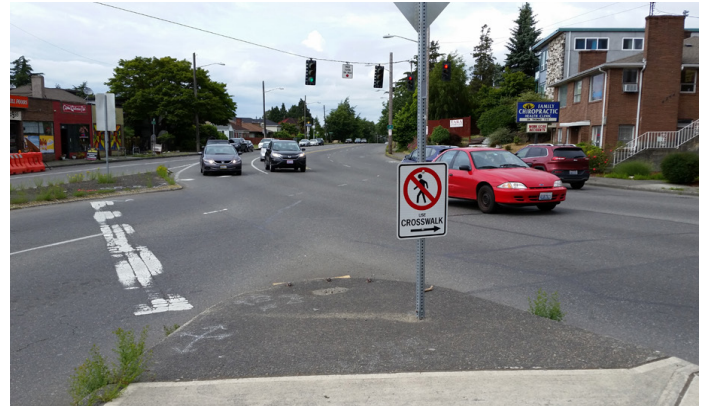
A small pedestrian "island" sits in the middle of 15th Ave S and S Columbian Way, near fast-moving vehicles.