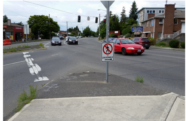
Looking northwest from the center of the island on the west side of S Columbian Way at S Oregon St