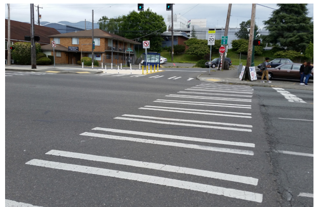
Looking east from the southwest corner of the intersection of S Oregon St and 15th Ave s