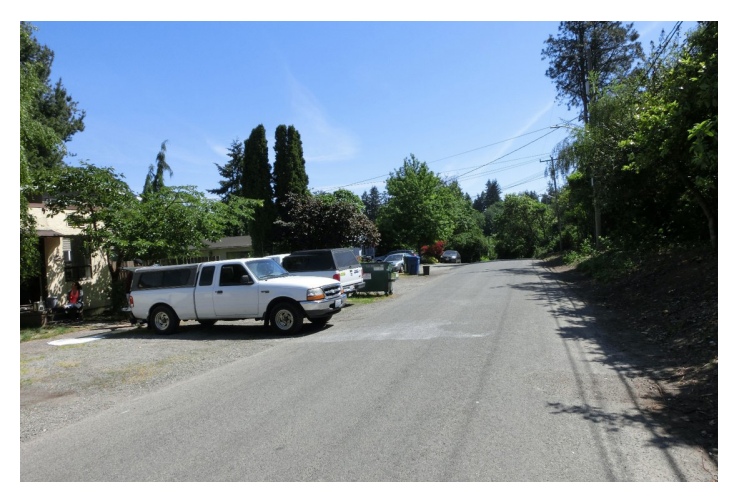
There are no existing sidewalks on NE 85th Street.