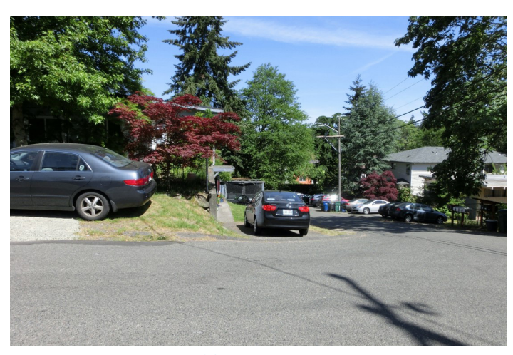
At the intersection of 23rd Avenue NE, a wall will need to be added to construct an ADA-compliant ramp.