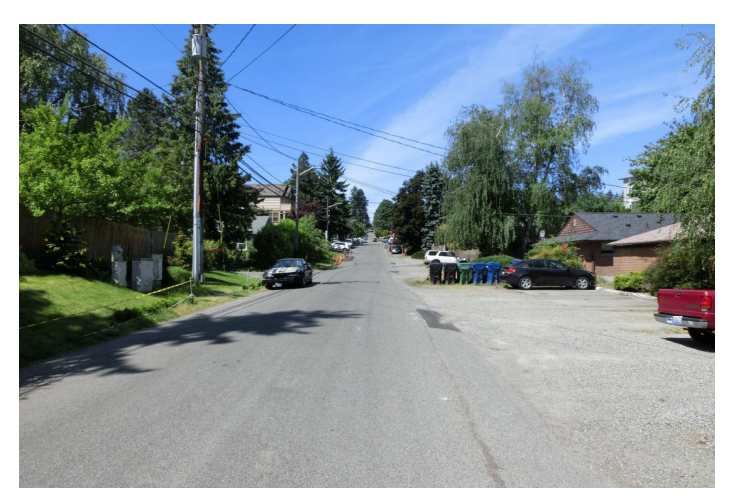
Power poles and other utilities are located on the south side of the street.