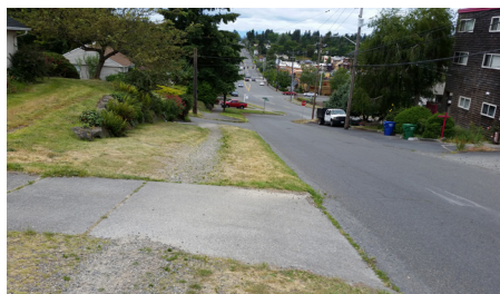
Looking west on the south side of SW Barton Street west of 23rd Avenue SW