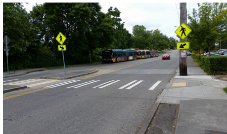
Looking SW at the north side of SW Barton Street at the Longfellow Creek crossing