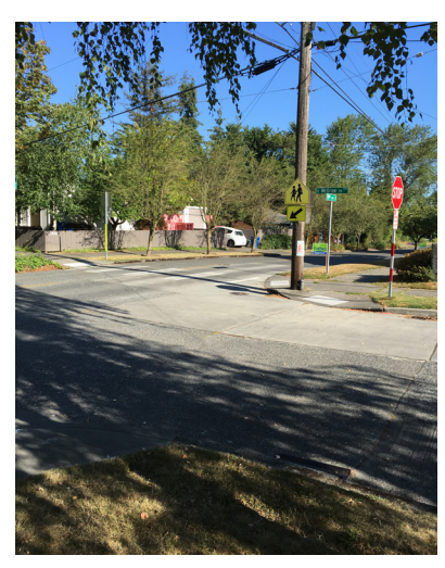
Intersection of E McGraw St & 19th Ave E