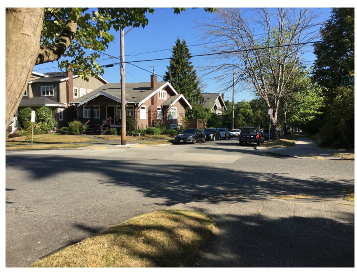
Intersection of E McGraw St & 20th Ave E

No improvements for these locations are proposed as part of the NSF program.