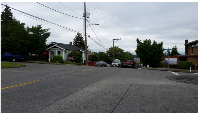
Looking east from the southeast corner of SW Oregon St and 39th Ave SW