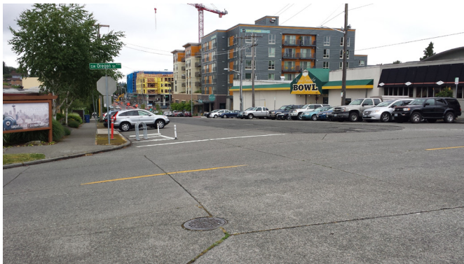
Looking south from the NE corner of SW Oregon St and 39th Ave SW