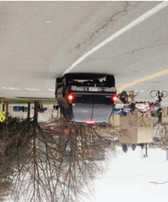
E Green Lake Way N is one of several streets in the neighborhood scheduled to be paved as soon as 2019.