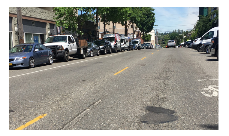
University Way NE is ready for repaving.

Approved by voters in 2015, the 9-year, $930 million Levy to Move Seattle provides funding to improve safety for all travelers, maintain our streets and bridges, and invest in reliable, affordable travel options for a growing city.