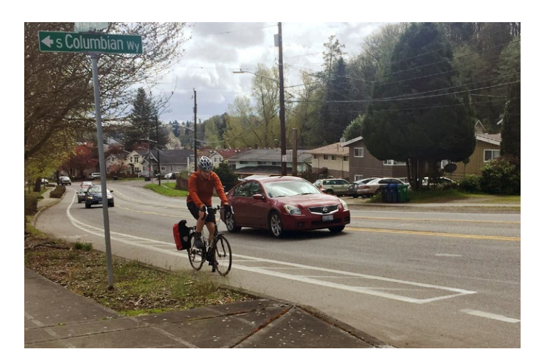
S Columbian Way/S Alaska St needs to be repaved

Starting this May, one contractor will be constructing 3 SE Seattle paving projects. We are still working with the contractor on how they will phase the 3 projects. We will provide notice in advance of the contractor working near you.