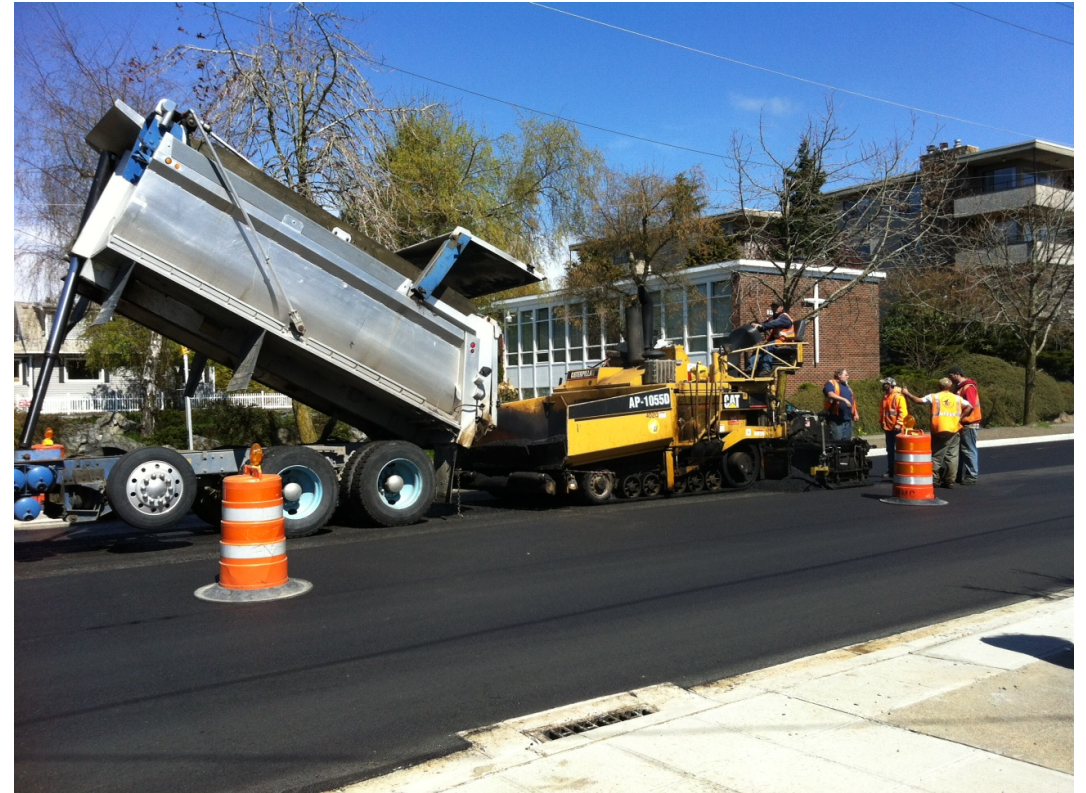
Crews perform paving work in Seattle