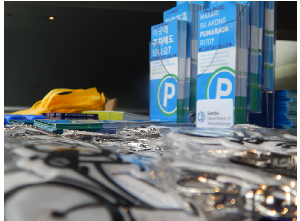
SDOT outreach materials