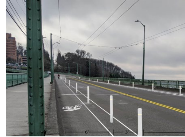
12th Ave S Vision Zero Project https://www.seattle.gov/transportation/ projects-and-programs/safety-first/ vision-zero/projects/12th-ave-s

(206) 900-8728 BeaconHillBike@seattle.gov