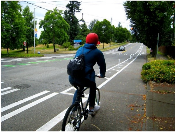
Beacon Hill Bike Route Project seattle.gov/transportation/BeaconHillBike

(206) 900-8728 BeaconHillBike@seattle.gov