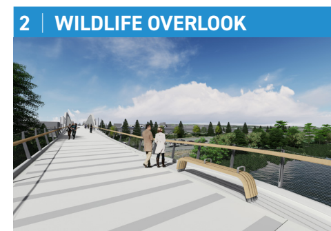
The wildlife overlook offers bridge users a resting spot and a view of the pond and wetland