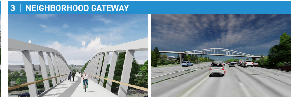
The sweeping lines of the bridge where it crosses over southbound I-5 create a memorable point of passage between communities