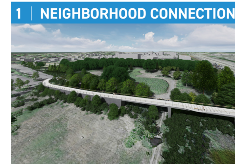
Direct connection at grade allows for open sightlines across the bridge