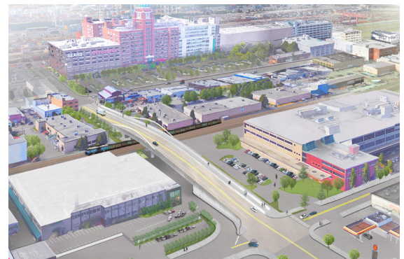
Conceptual rendering of the new Lander St Bridge