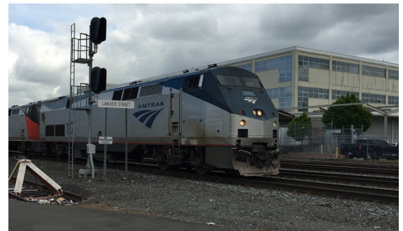
Amtrak train traveling across Lander St