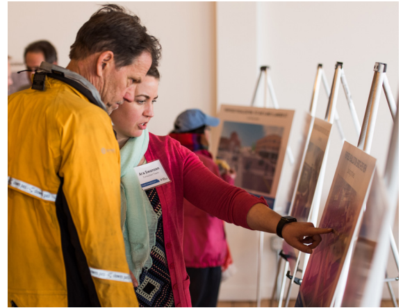
Gathering public input at a project open house