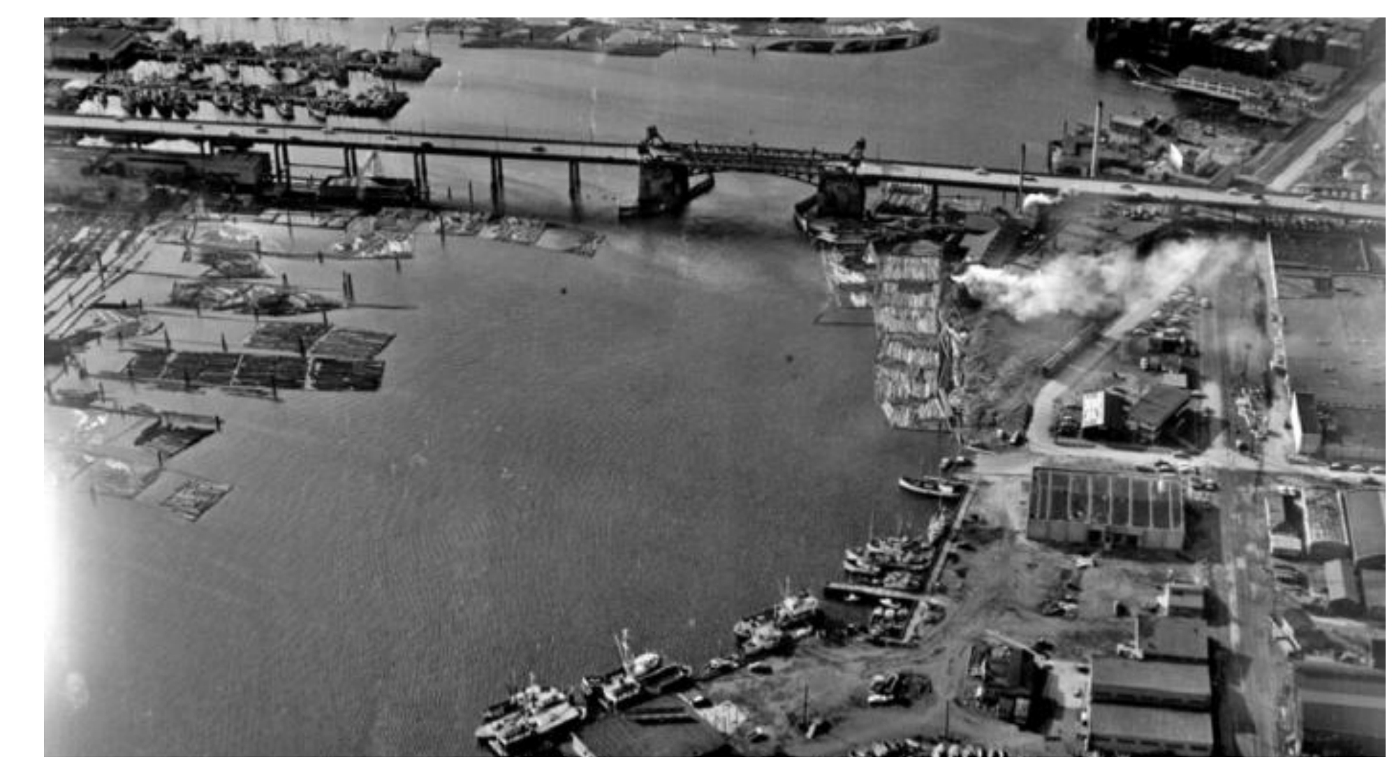
Ballard Bridge (1957)