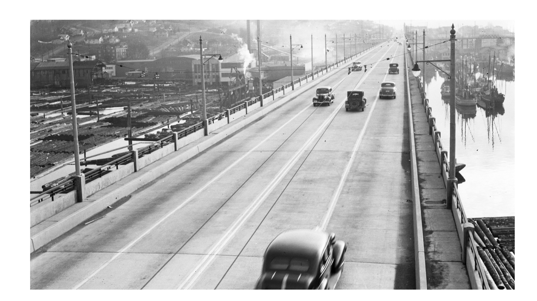
Ballard Bridge Facing North (1956)

The Ballard Bridge, built in 1917, spans the eastern edge of the Salmon Bay and connects Ballard to Magnolia, Queen Anne, and Downtown via Interbay. Today the 2,854-foot bridge carries more than 57,000 vehicles per day across the Lake Washington Ship Canal. Over the last century, while the look and function of the bridge may not have changed much, we've been retrofitting and maintaining the structure to keep it moving and safe, including a recent series of seismic improvements completed in 2014.