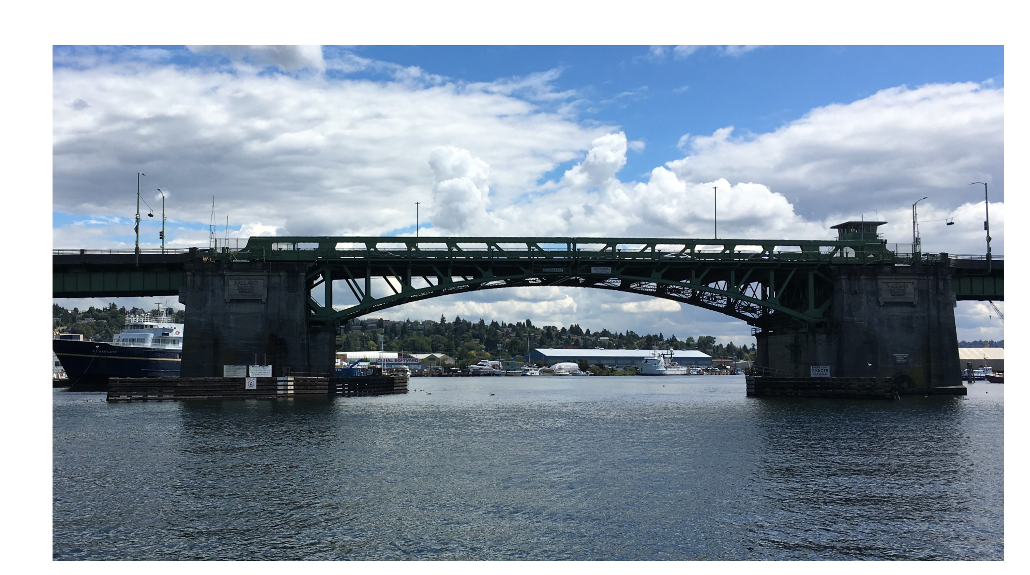
Ballard Bridge Facing East