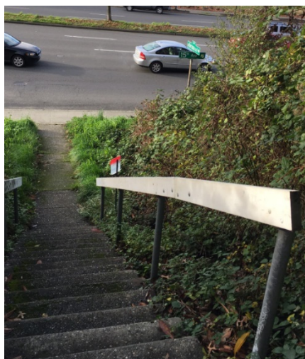
Existing stairway at 15th Ave W & W Bertona St

This project is funded by the 9-year Levy to Move Seattle, approved by voters in 2015.