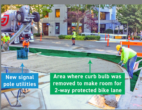
Pouring new curb ramps and sidewalks at 2nd Ave and Cedar St

with new 2-way protected bike lane and left turn/parking lane.