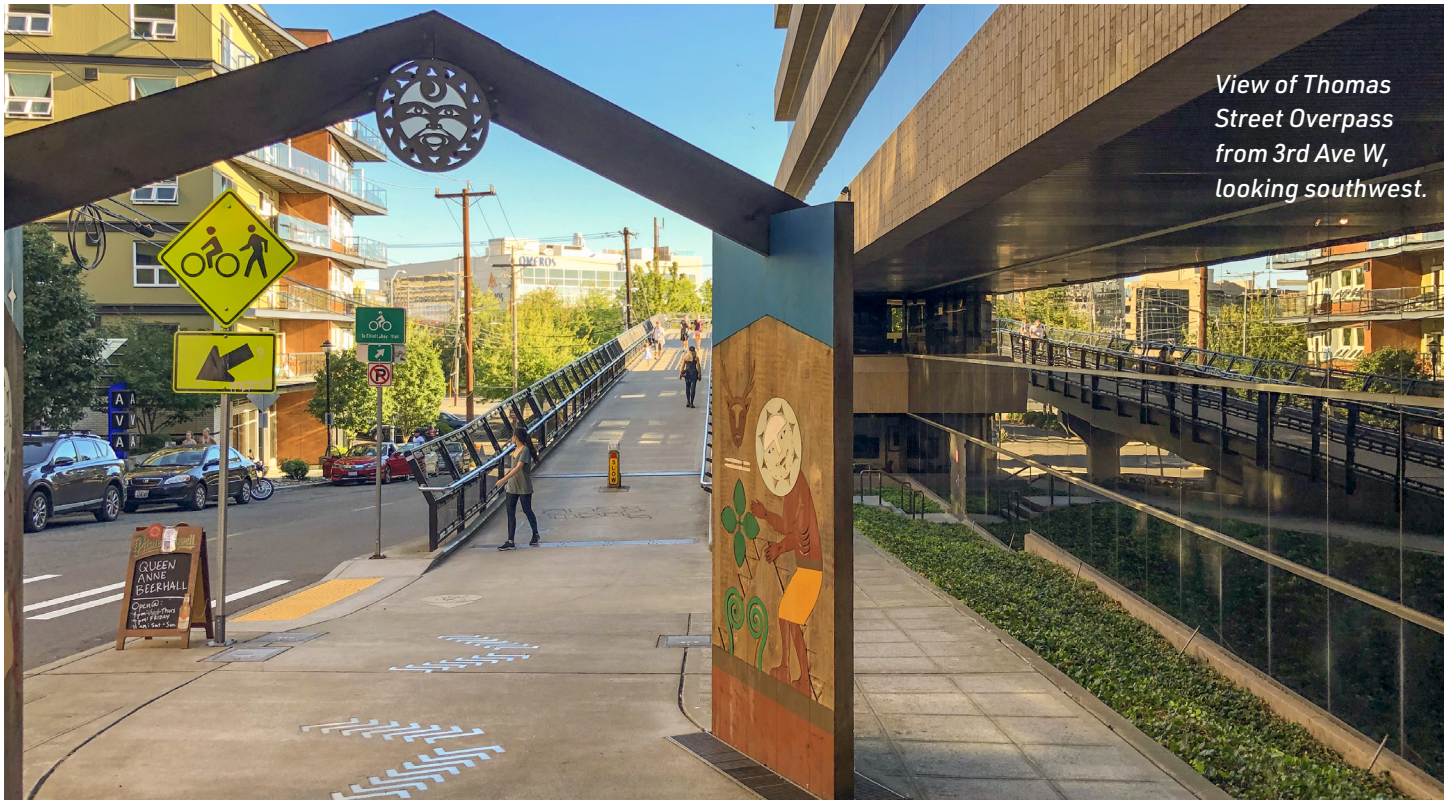
View of Thomas Street Overpass from 3rd Ave W, looking southwest.