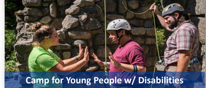
Camp for Young People w/ Disabilities