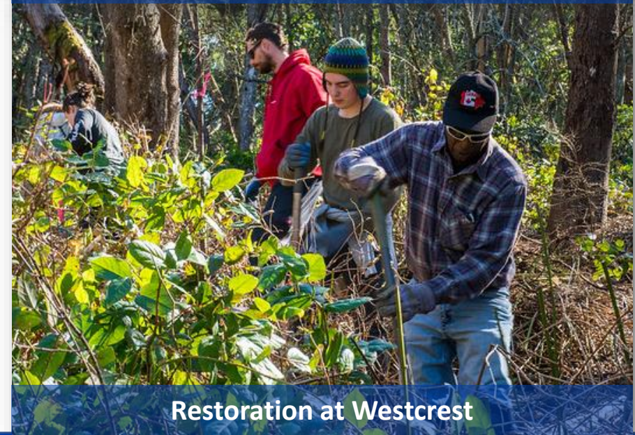
Restoration at Westcrest