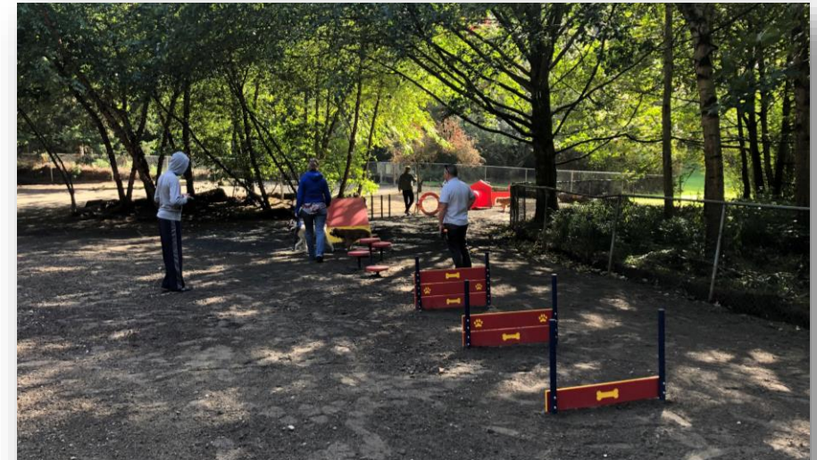
Golden Gardens Off-Leash Area