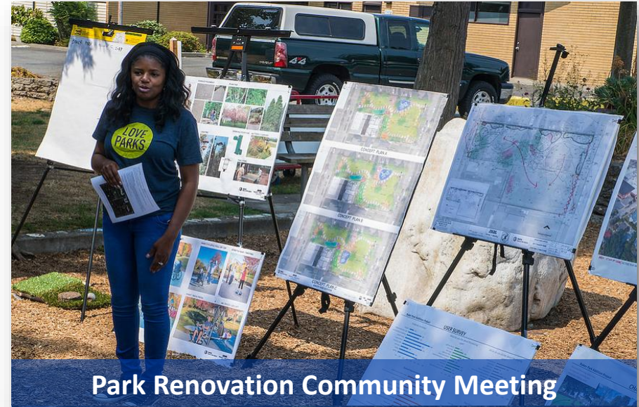
Park Renovation Community Meeting