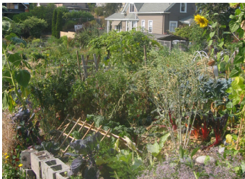
University Heights P-Patch