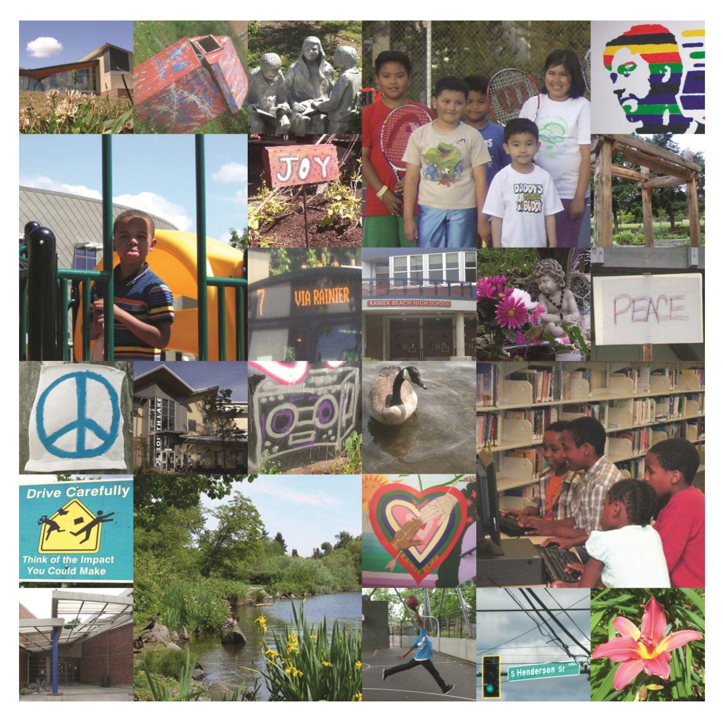
For more information about go to www.rbcoalition.org

Rainier Beach 2014 Neighborhood Plan Directory Edition 1 Volume 2 A Work-in-Progress, Version 6.1 for more information email <a href="mailto:rainierbeachmovingforward@gmail.com">rainierbeachmovingforward@gmail.com</a>